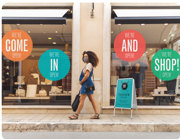
Indoor and outdoor signage

Add a finishing solution to create an even larger assortment of unique, high-value products — with a full portfolio of products and services, Ricoh can help you create a complete end-to-end process.