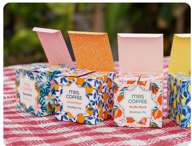
Short-run specialty packaging