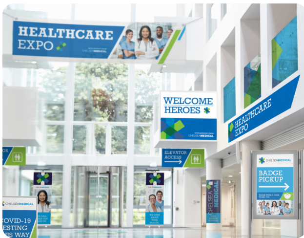
Events and exhibitions